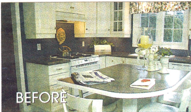
► Colleen O'Hara has used many of the homeowner's items, in addition to a few of her own, to refine and refresh both rooms in preparation for sale.